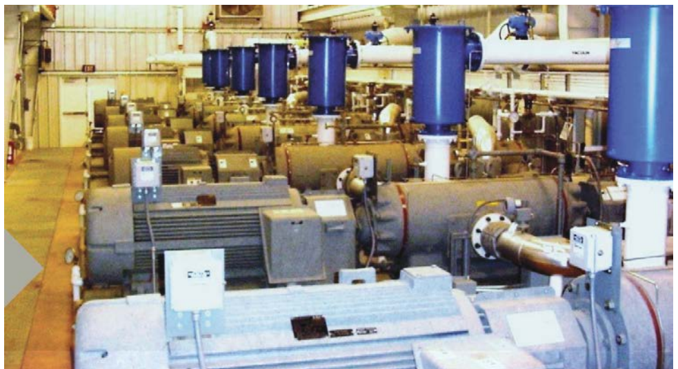
TESCORP was chosen to remanufacture all of the rotary vane compressors at NASA wind tunnel facilities located in the Marshall Space Flight Facility.

TESCORP guarantees the new parts installed in your compressor will be free of defects on all remanufactured parts for two (2) years.